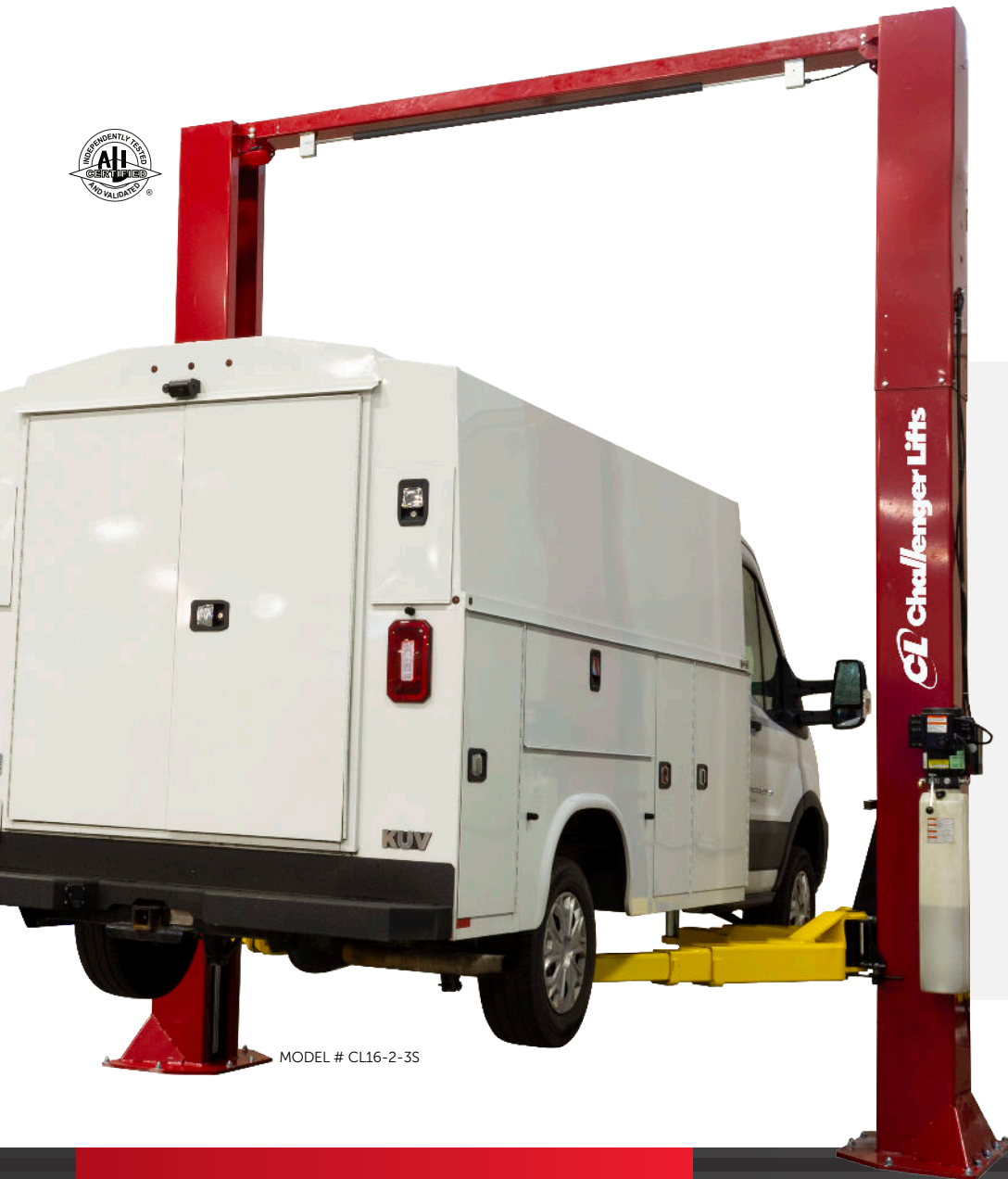
MODEL # CL16-2-3S