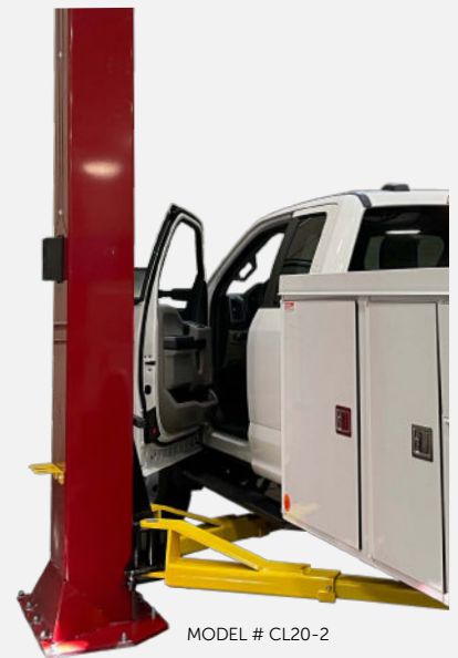
MODEL # CL20-2