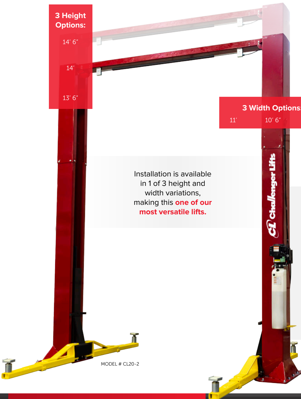
MODEL # CL20-2

Stack adapters and organizer racks with hardware included. • 16K Model includes: 3" & 6" • 20K Model includes: 4" & 8"